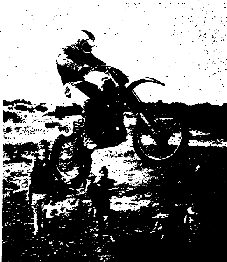
A motorcyclist in a scrambling exhibition on the Netanya beach yesterday.

The passer-by was a 65-year-old local man, out for a stroll with his wife. He was taken to the Beilinson Hospital. The shooting was reportedly in connection with a love affair.